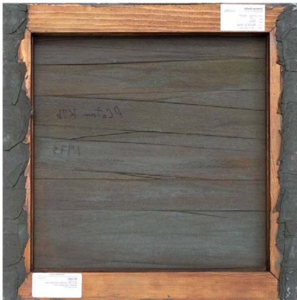
Figure 3: Paolo Contani_Bende Elastiche (Elastic Gauzes) (back side) Gauzes and Acrylic 60 x 60 1975