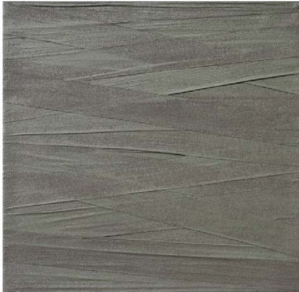
Figure 2: Paolo Contani Bende Elastiche (Elastic Gauzes) Gauzes and Acrylic 60 x 60 1975