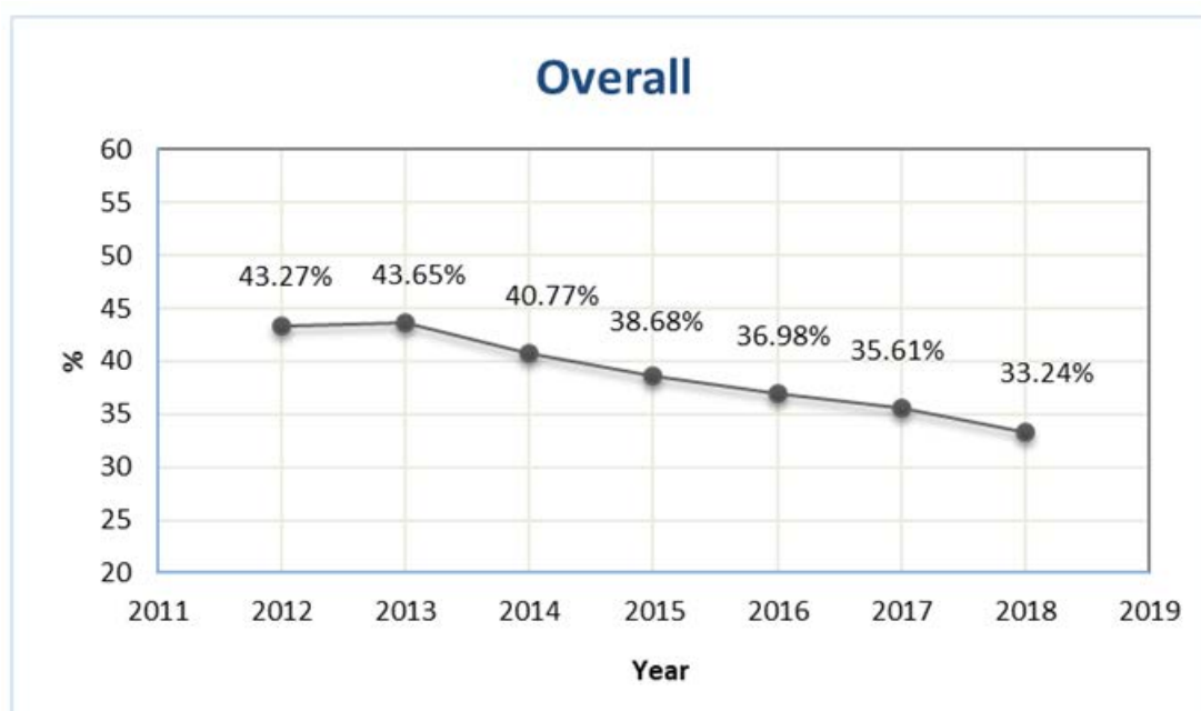
Figure 1. Prevalence of outpatients older than 65 years exposed to at least one potentially inappropriate prescription in Piedmont in the period 2012–2018.

The number of older patients exposed to at least one PIP was 418,537 and 429,670 in 2012 and 2013, respectively, corresponding to 43.3% and 43.7% of the total number of older outpatients with at least one prescription (Figure 1). During the study period, the prevalence showed a sharp decrease, reaching 33.2% in 2018 (Figure 1).