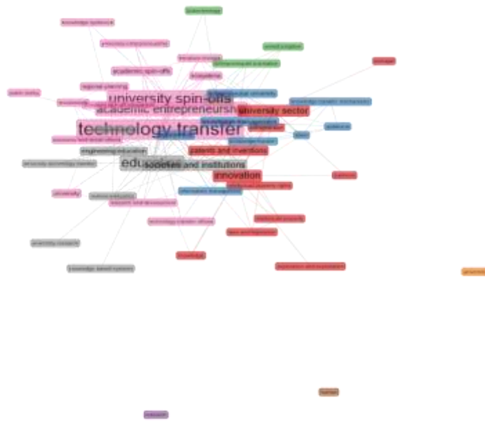
Figure 1. Topics of research on the spin off and university

In Italy the number of spin-offs still appears to be still limited compared to the potential held in universities scattered throughout the peninsula (Iacobucci & Micozzi, 2015). This is because the whole system is still relatively new and little used by the operators in the sector and, moreover, in order to observe the results of the efforts made in creating a spin-off, waiting times are quite long and difficult to analyze for the singularity of each spin-off. Especially when you observe the time necessary for a new company of this type to be able to detach itself from its mother university and become independent, or how long it takes the young company to get investments and have its own capital and available means, the precise estimate is difficult (Colletti G., 2018).