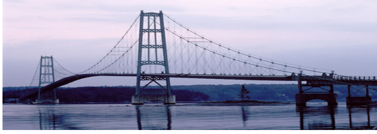
FIGURE 2. The Deer Isle Bridge.

More generally we may consider a force h satisfying the following assumptions: