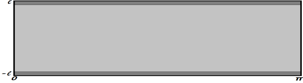
FIGURE 1. The plate \Omega and its subset \omega (dark grey) where the hangers act.

see (15) below. The equilibrium position is then given by the unique solution of