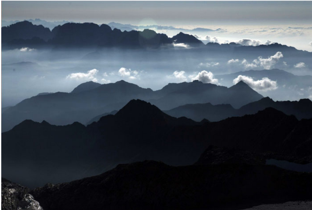
Giorgio Salomon, Shadows of Dolomites , 2006. © copyright Giorgio Salomon

Between Journal is published by the University of Cagliari - Maintenance for this OJS installation is provided by UniCA Open Journals , hosted by Sistema Bibliotecario di Ateneo .