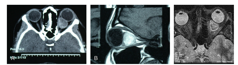
FIGURE 2. A-C, Computed tomography and MRI scans showing left retrobulbar intraconal hematoma.

hematoma, left exophthalmos, and decreased extraocular muscle motility. The direct photomotor reflex and the visual acuity were progressively deteriorated. Computed tomography and MRI showed left retrobulbar hematoma (Figs. 2A–C) without concomitant maxillofacial fracture. Chemotherapy was started with intravenously administered dexamethasone 4 mg every 12 hours for 2 days; the patient underwent immediate decompressive surgery.