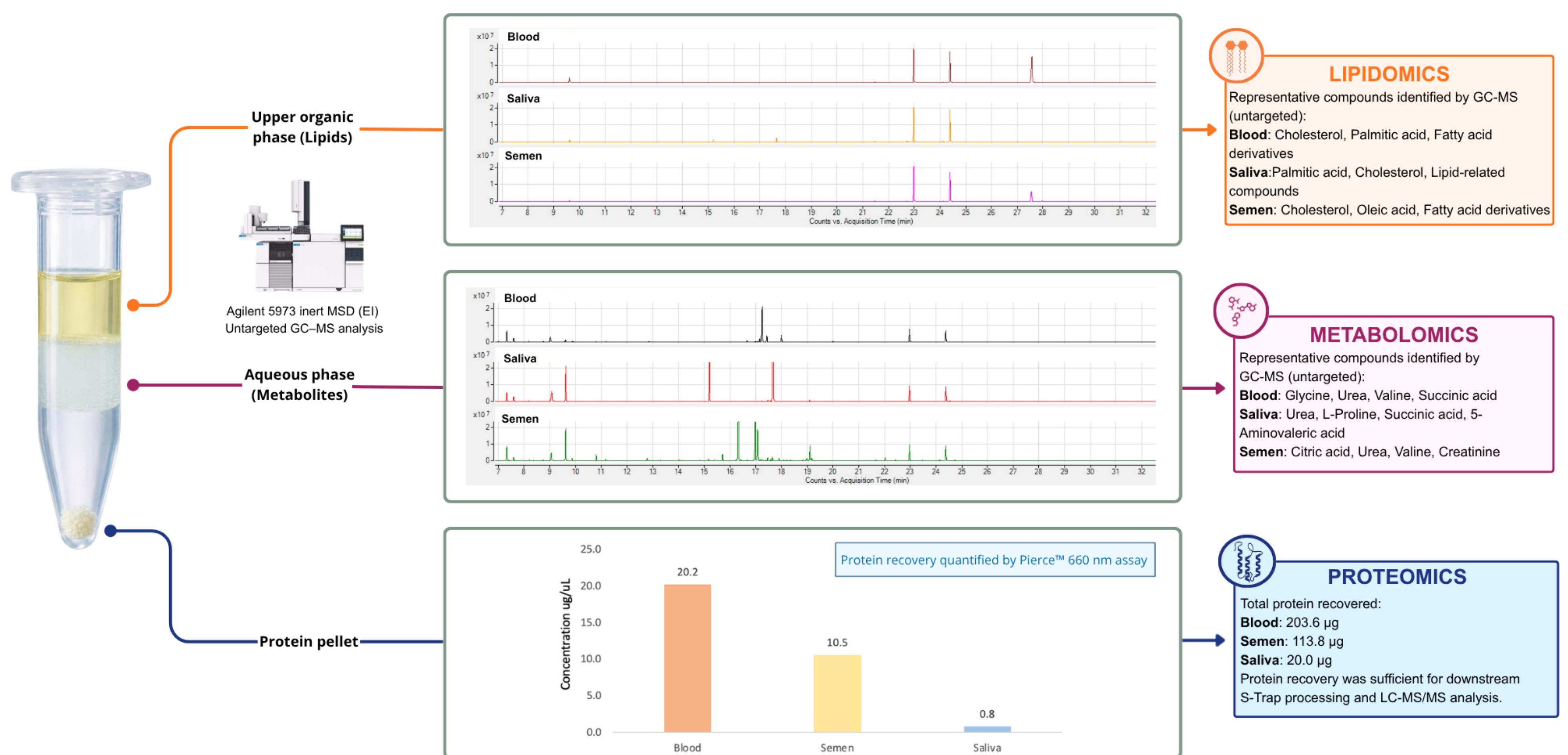
Figure 3: Optimised MTBE-based biphasic extraction enabled simultaneous recovery of lipids, metabolites and proteins from a single 20 µL trace. Representative untargeted GC-MS profiles show distinct molecular signatures across blood, saliva and semen, while protein quantification confirmed sufficient recovery for downstream S-Trap and LC-MS/MS analysis.

Five extraction protocols were tested for simultaneous recovery of metabolites, lipids and proteins from a single 20 µL trace. The MTBE-based biphasic extraction ( Matyash method ) showed the best overall performance.