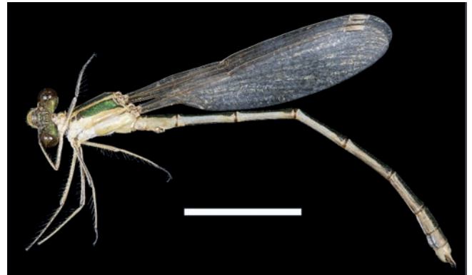
Fig. 2 – Immature male Lestes barbarus. Artificial pond at Cascina Lai (TO; NW Italy). 20.07.2021. First record for Piedmont. / Lestes barbarus maschio immaturo. Stagno artificiale presso Cascina Lai (TO, Italia Nord-Occidentale). 20.07.2021. Primo dato per il Piemonte.