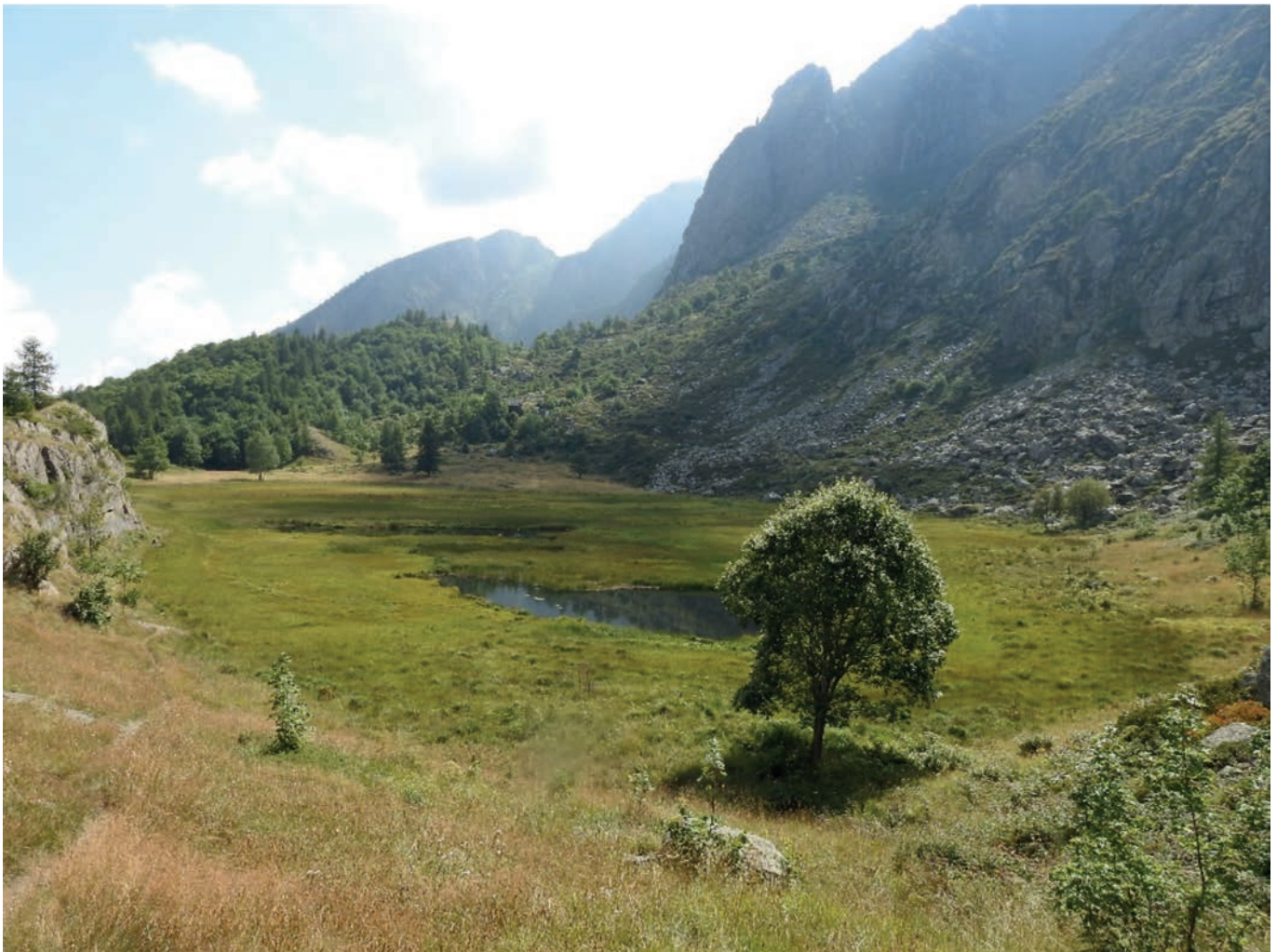
Fig. 1 – Lac Falin peat bog (TO; NW Italy). 14.08.2021. / Torbiera di Lac Falin (TO; Italia Nord-Occidentale). 14.08.2021.