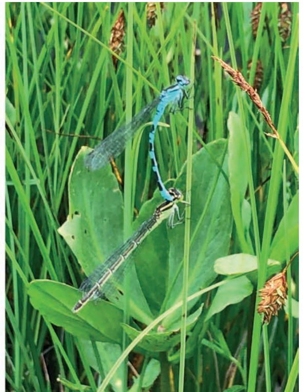
Fig. 3 – Coenagrion hastulatum (male and mating pair). Lac Falin peatbog (TO; NW Italy). 15.07.2023. First record for Piedmont. / Coenagrion hastulatum (maschio e coppia in accoppiamento). Tobiera di Lac Falin (TO, Italia Nord-Occidentale). 15.07.2023. Primo dato per il Piemonte.