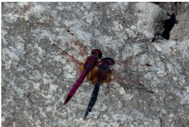
Fig. 4 – Male Trithemis annulata. Lago di Viverone (BI; NW Italy). 20.07.2020. First record for Piedmont. / Trithemis annulata maschio. Lago di Viverone (BI; Italia Nord-Occidentale). 20.07.2020. Primo dato per il Piemonte.