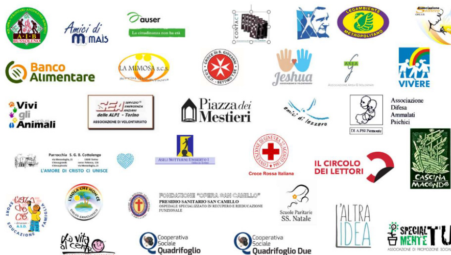
Figure 1. The host organizations of civil service Vol.To.

The representation of the impact of activities and stakeholders is made even more complicated as each third sector entity has one or more public, private or third sector entities as a partner (Appendix A).