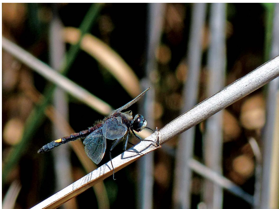
Fig. 4 – Leucorrhinia pectoralis male. Torbiera di S. Colomba. 20 Jun 2017.

Recent research lead to the discovery in 2017 of a small population in a -suboptimal- site 1 km far from Fornace (Torbiera di Santa Colomba; Assandri & Bazzi, unpub.; Fig. 4) where the reproduction of the species was confirmed in 2018. Moreover, further two males were observed in another site 2.7 km far from Fornace in 2017 (Palù Gross; Assandri, unpub.). Additionally, the study of the CMT collection allowed the discovery of a male specimen, overlooked until today, coming from Santa Colomba, dated 18.07.1951, possibly suggesting that the