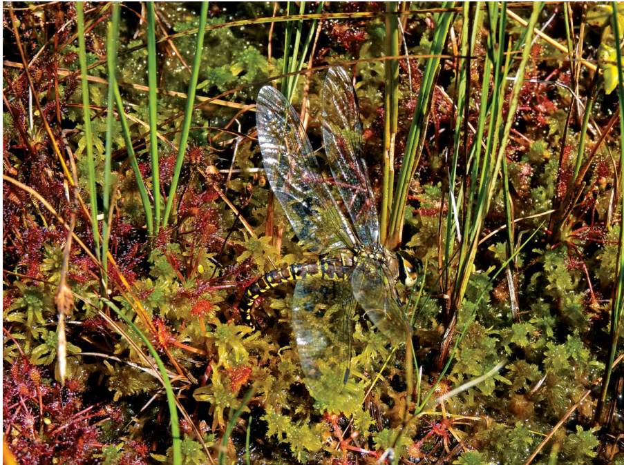
Fig. 3 – Aeshna subarctica female ovipositing in a raised bog. Lac del Vedes. 01 Aug 2017.